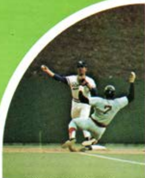
Kansas City Royals