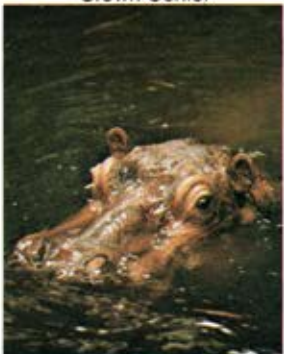
Swope Park Zoo