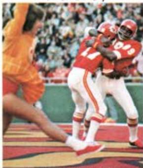
Kansas City Chiefs