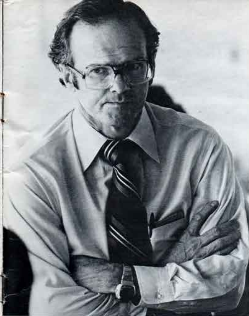
DECISIONS: Lamar Hunt contemplates the future plans for Worlds of Fun.