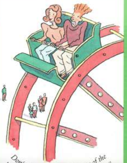
Don't look down! From the top of the breathtaking SKYLINER, it's funny how everyone below looks like ants.