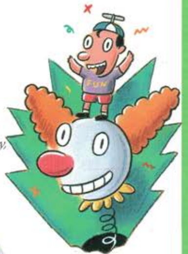
Don't miss the magic of our June KIDSFEST! These activities will bring smiles to little ones of all ages.