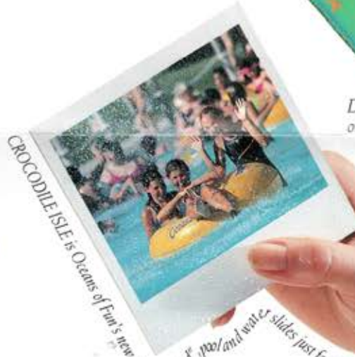
CROCODILE ISLE is Oceans of Fun's new "Sprayground" pool and water slides just for kids. Wheeee!