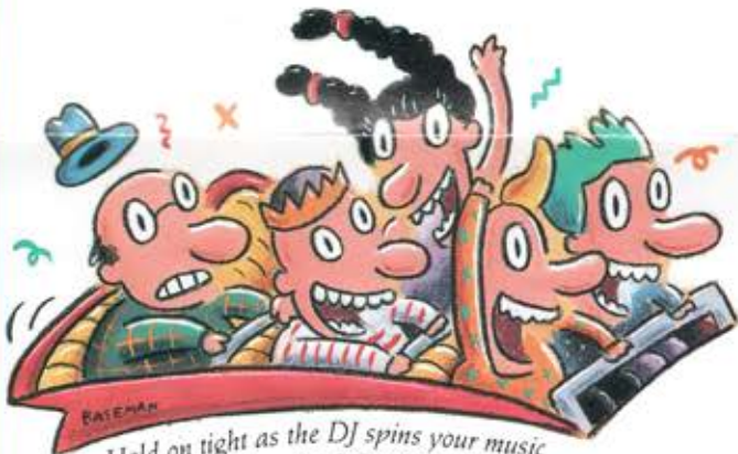
Hold on tight as the DJ spins your music and your mind on the ROCKIN' REELER.