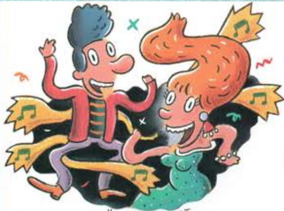
Bring your friends to the all-new BEAT STREET, a rockin' kind of Coney Island where the music, games and fun are non-stop!