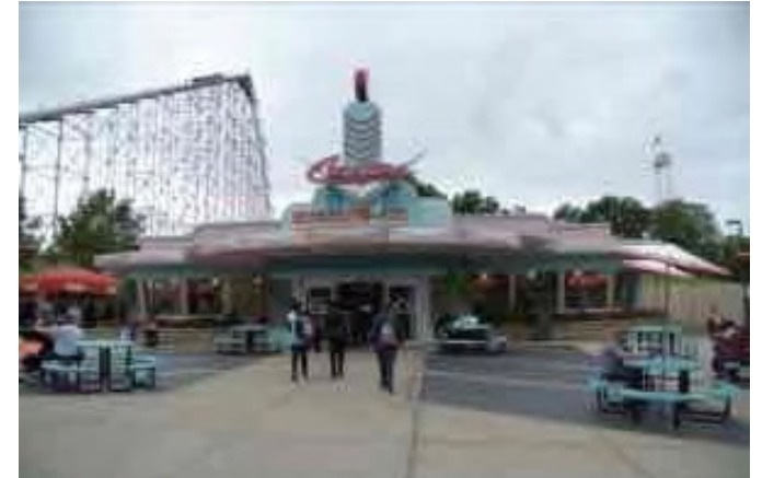
Coasters Drive-in 1999-current

Coasters Drive In, added in 1999, is one of three of the park's indoor counter service restaurants, in Coasters case, themed to a 1950's diner. Coasters serves burgers, fries, and milk shakes. Though Coasters is listed on the official park map as being located in Americana (an attempt to fix the theming issue), it is directly along the pathway to Mamba and Monsoon, which is why it is listed as Africa in this listing.