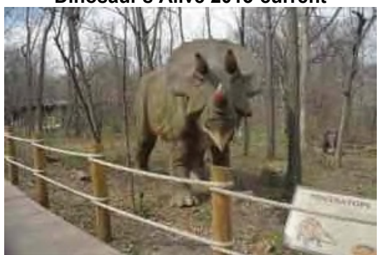
Dinosaur's Alive 2013-current

Added as a new pay-extra attraction in 2013, Dinosaur's Alive is $5 for a single day regular ticket admission and included free for season pass holders. Dinosaur's Alive is an interesting, and rather educational, walk through past life-size Dinosaur animatronics. The entire area is shaded and is fascinating to visit anytime during the daytime. Dinosaur's Alive closes at dusk. As many who have visited the park for years have noted, Dinosaur's Alive is built, at least partially, on the land previously occupied by Zambezi Zinger. In fact, the Zinger's tunnel was originally planned to be used as part of the attraction but was reburied when it was determined to be unsafe. The tunnel, though buried and unable to be seen, is located approximately near the final scene featuring an egg nest.