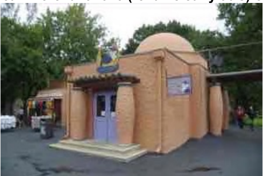
Moroccan Merchant 1973 (rename early 90's)-current

Across from Boomerang is the Moroccan Merchant gift shop, offering t-shirts, plush, as well as