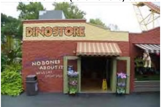
Dino Store 1973 (rename 2013)-current

The exit to Dinosaur's Alive ends in this shop, but can be entered from the midway also; it features a wide variety of dinosaur-related merchandise including fossils, t-shirts, and dinosaur plush. The