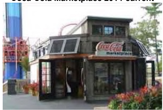
Coca-Cola Marketplace 2014-current

As the largest strip of shops in the park, Front Street is a great place to stop on your way out of the park. Front Street Shops include the Emporium Gift Shop, Peppermint Patties Candy Shop, Cinnabon, Caribou Coffee Shop, and Caricature Artist. Front Street Shops is as large and as organized as it is because it once served as part of the Front Gate of the park when the main gate was located across from it where Steelhawk is today. Though the main gate has been removed, the overall layout of the main plaza has remained relatively unchanged; the candy shop, which started out in 1973 as (Sharon's) Yum Yum Tree, is still a candy shop (today known as Peppermint Patties), Front Street Emporium started out as Front Street Dry Goods and Electric Company, in 1973, and then Brims and Bonnets, the park's hat store, was only recently converted from Charlie's Caps to Guest Services in 2015. One of the more fascinating aspects of Front Street is in the small ways that it has changed. For instance, where Cinnabon and Caribou Coffee are today used to not be shops at all, but instead were breezeways that connected the front of the park directly to the train station; this was prior to Blue Bronco/Battle Creek BBQ's construction in 1985.