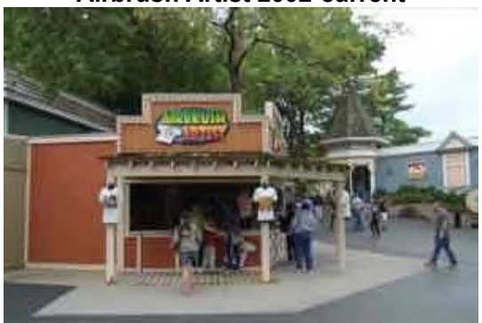
Airbrush Artist 2002-current

This small booth offers artistic airbrush souvenirs such as t-shirts and caps.