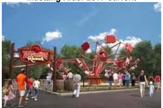
Mustang Rider 2017-current

Added in 2017 is Mustang Rider, a Troika ride manufactured by Huss Rides of Germany. Troika's name derives from the Russian word for "three" referring to the ride's three arms. Troika is a fairly mild mannered thrill ride; each of the three arms has 7 individual cars attached which spin, while the center hub also spins, while doing so each arm is gently lifted into the air. Like Scrambler, Troika is a great mild thrill ride to work up to the more intense rides. Mustang Rider is replacing, in location, Krazy Kars,