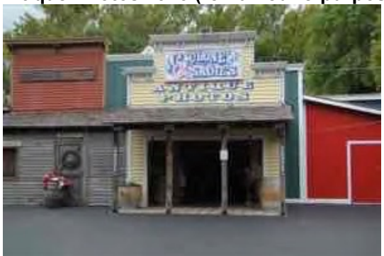
Cyclone Sadies Antique Photos 1973 (re-named/re-purposed 2002)-current

Dress up in 19th century style and have your antique photo taken; great for families, friends, or even couples. Interestingly enough, the location of Cyclone Sadie's Antique Photos started out as the park's fun house, originally named "9th Street Incline", in 1976 became known as "Great American Disaster" before changing to it's final name, Cyclone Sadie's, in 1980. In 1994, when Cyclone Sadie's (the fun house) was replaced by an arcade, the name and signage stuck around, so in 2002 when the antique photo shop moved to replace the arcade it took on the name as well, and became Cyclone Sadie's Antique Photos.