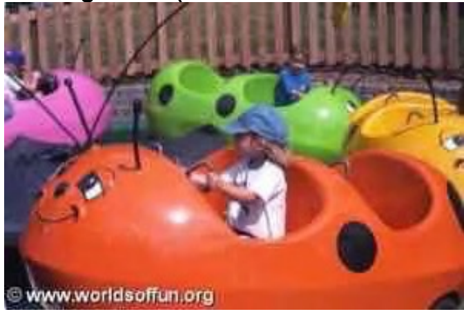
Linus Beetle Bugs 1979 (re-named/re-located 2001)-current

Like Turn Tyke, Beetle Bugs is a small circular car ride, in which the cars are themed to lady bugs, that rotate around a small, undulating track. Riders must be 54" or under to ride. Linus Beetle Bugs was introduced to Worlds of Fun in 1979, as Beetle Bumps, and was at that time located in the Orient section, exactly where the Coca Cola Freestyle is today (the pagoda is the same general structure). Beetle Bumps was relocated to Camp Snoopy and re-named in 2001. Riders must be under 54" to ride.