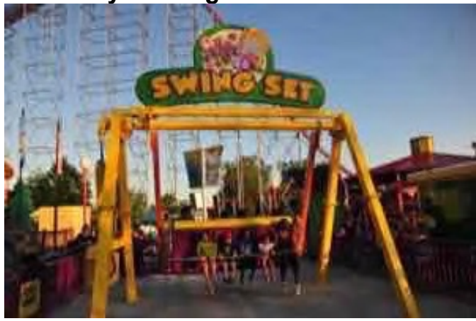
Sally's Swing Set 2011-current

A fun and mild ride that children and adults can ride together, Sally's Swing Set is basically a gigantic swing that can hold up to 12 riders at a time. Sally's Swing Set is better known as a Happy Swing manufactured by Zamperla Rides; it was introduced at Worlds of Fun in 2011. Riders must be 36" tall to ride.