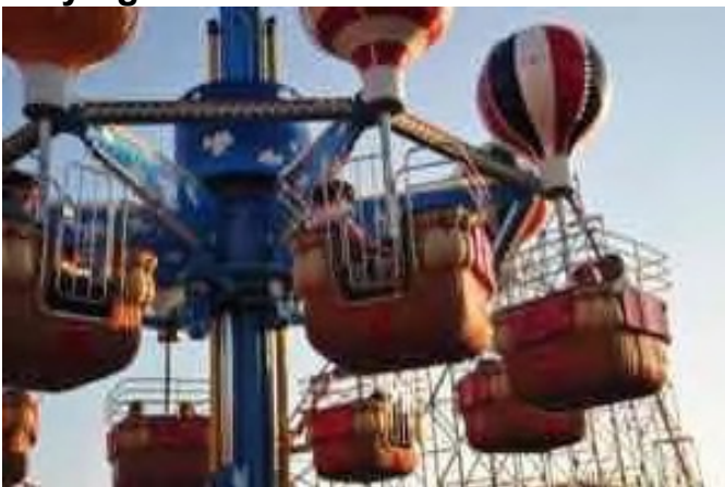
Flying Ace Balloon Race 2011-current

Guests can get an aerial view of Planet Snoopy aboard the Flying Balloon Race, a 38-foot tall tower ride. Guests board one of 8 balloon cars, which can seat up to four, which are raised up the tower in the air; riders have the option to also spin their personal balloon car or allowing it to stay stationary. Flying Balloon Race was added to the park in 2011; built by Zamperla Rides and categorized as a Samba Tower. Riders under 42" must be accompanied by an adult.