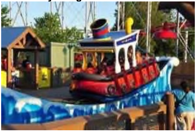
Lucy's Tugboat 2011-current

A fun and slightly thrilling family ride situated just next to Peanut's Playhouse. Riders board a 24-person "tug boat" situated on a curved track. As the ride starts the tug boat car begins to swing up and down the curved track while also slowly spinning. Lucy's Tugboat is more commonly referred to as a Rockin' Tug, and was manufactured by Zamperla Rides; it was voted best new ride of 2002 when it was introduced at the yearly-IAAPA tradeshow. Lucy's Tugboat was introduced to Worlds of Fun in 2011. Guests must be 42" tall to ride unaccompanied.