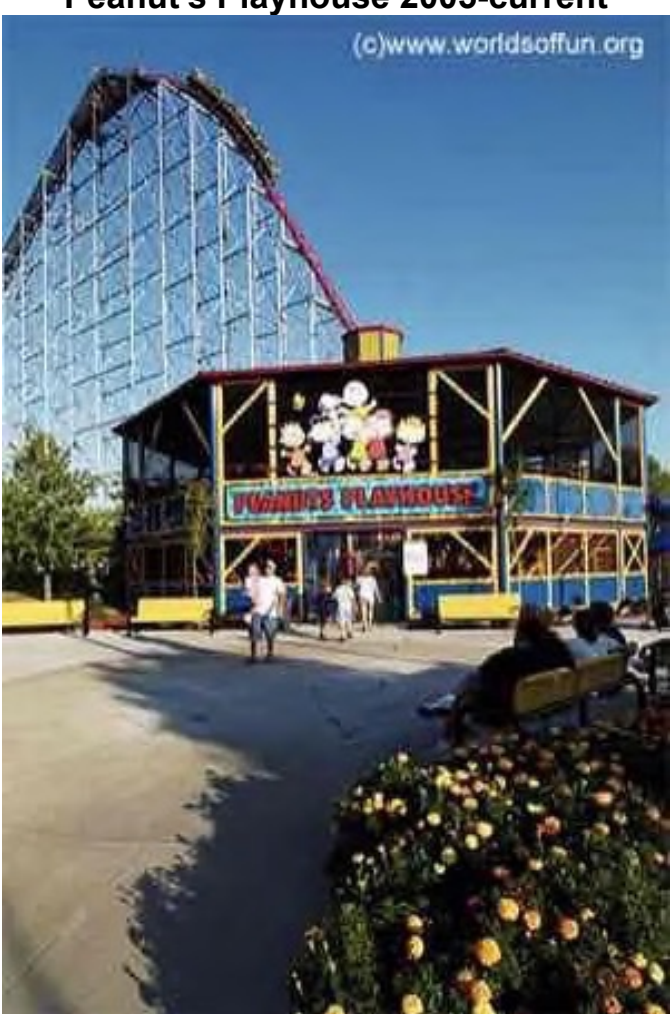
Peanut's Playhouse 2005-current

Guests looking for a place to let kids run free and burn off steam should head to Peanut's Playhouse, a completely enclosed, indoor foam ball playground. Peanut's Playhouse requires guests under 36" to accompanied by an adult, those over 54" must be accompanied by a child.