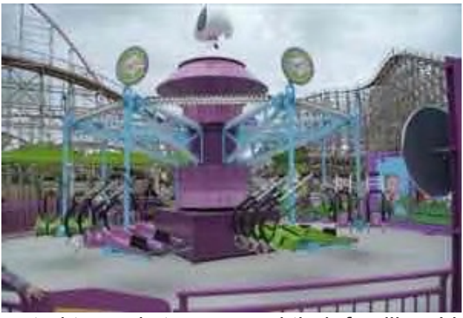
Linus Launcher 2016-current

A slightly more thrilling ride targeted towards tweens and their families, Linus Launcher is a circular ride that riders experience in a "lay down" position and allows them to experience a type of "free flight" as the ride rotates and side by side cars move in a wave-like fashion. Linus Launcher was added in 2016, and manufactured by Zamperla Rides. The ride is mostly commonly referred to as a Kite Flyer; Worlds of Fun's version allows for 16 riders per ride cycle. Guests must be 42" or taller to ride.