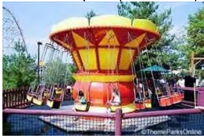
Charlie Brown's Windup 1987 (re-named 2011)-current

A small circular ride, children ride in a small seat that, once the ride begins, circles the central hub. Charlie Brown's Windup can only be ridden by those 54" or under and riders must be at least 36" tall to ride. Charlie Brown's Windup was introduced to Worlds of Fun in 1987 with the addition of Pandamonium and was known then as the Swing-A-Ling.