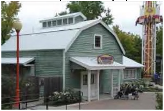
Family Care Center 1978 (re-named/re-purposed 2011)-current

Located between Planet Snoopy and Detonator, the Family Care Center was added in 2011, and offers not only an auxiliary Guest Relations separate from the main gate, but also a respite from the park for families with small children, and has a special room set aside for breastfeeding mothers. In the grand, Worlds of Fun tradition of re-purposing old buildings multiple times over, the Family Care Center structure was originally built in 1978 as a gift shop as part of the Aerodrome, and was known as Great Waldo Crankshaft's Prop Shop. In 1987, when the Aerodrome became Pandamonium, it was renamed to Pandarama. When Detonator opened in 1996, adjacent to the gift shop, it was renamed once more to Launchpad Gifts. It was renovated in 2011 from a gift shop to the Family Care Center.