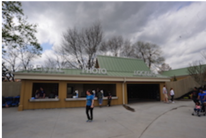
Photo Memories 2017-current

Purchase your photo memory of your day at Worlds of Fun here! Photo Memories also offers a small selection of souvenirs as well.